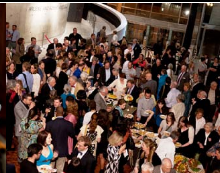
Crowd gathers at opening night of Ah, Wilderness!