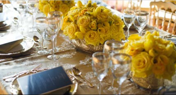
Delicate golden buds adorn each table