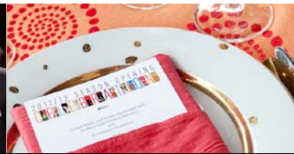
Invitation to the Season Opening celebration