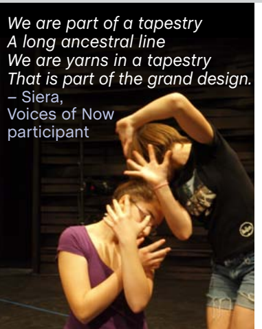
We are part of a tapestry A long ancestral line We are yarns in a tapestry That is part of the grand design. – Siera, Voices of Now participant