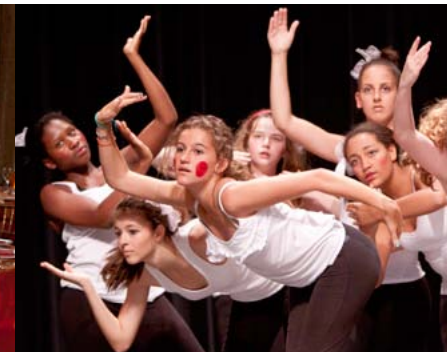
Students get creative for the noontime show at Camp Arena Stage