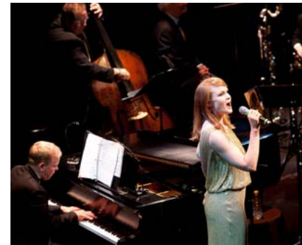
Kate Baldwin enchants audiences during the Golden Gala Celebration