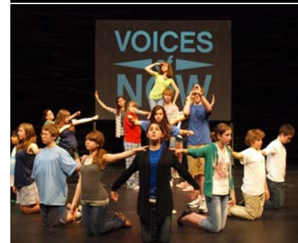
Voices of Now students showcase their final work