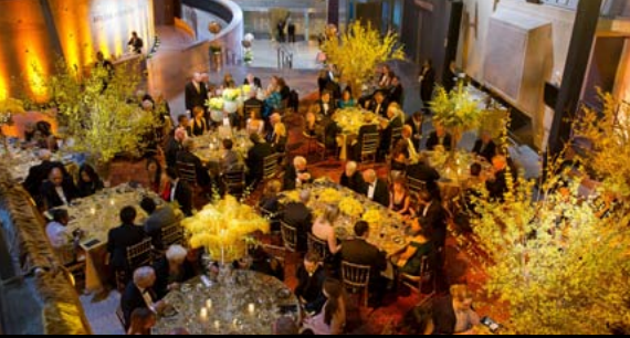
Guests marvel at the golden splendor over dinner