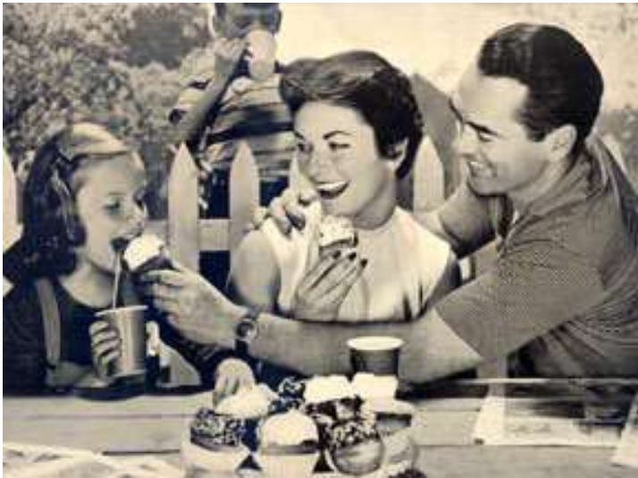
The ideal American family was a happy, perfect one.

In the 1950s America was coming to terms with the aftermath of World War II. The postwar era was a time of mixed messages in American culture. After the horrors of the war, many Americans longed to return to a more normal way of life, but the fear of attack was still there. The older generation was caught up in following proper etiquette, while the younger generation was practicing drills at school on how to protect themselves from atomic bombs.