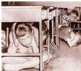
Children during an air-raid drill, showing not all was perfect in postwar America.

In the 1950s America was coming to terms with the aftermath of World War II. The postwar era was a time of mixed messages in American culture. After the horrors of the war, many Americans longed to return to a more normal way of life, but the fear of attack was still there. The older generation was caught up in following proper etiquette, while the younger generation was practicing drills at school on how to protect themselves from atomic bombs.