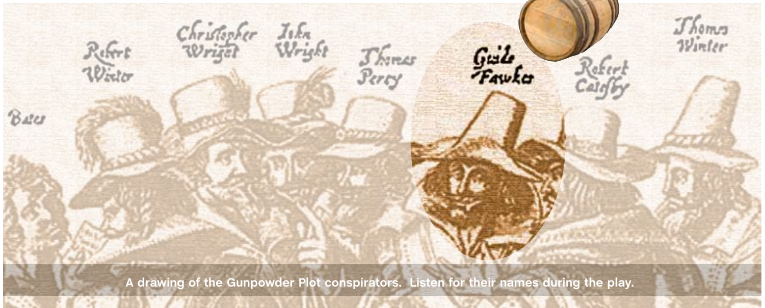
A drawing of the Gunpowder Plot conspirators. Listen for their names during the play.

At the center of Equivocation is the Gunpowder Plot: a Catholic plot to blow up the entire English government, including King James and his family, in 1605. The plot was foiled when guards stumbled on Guy Fawkes, who had been left in the House of Lords' cellar to light the fuse on 36 barrels of gunpowder. Fawkes gave the names of the conspirators under torture.