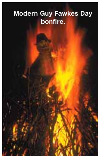
Modern Guy Fawkes Day bonfire.

They were either killed immediately by soldiers or convicted of treason and executed. Traitors were often drawn and quartered. The prisoner was hanged, cut down before death, then castrated, disemboweled, beheaded and cut into four pieces. The remains were often displayed as a warning.