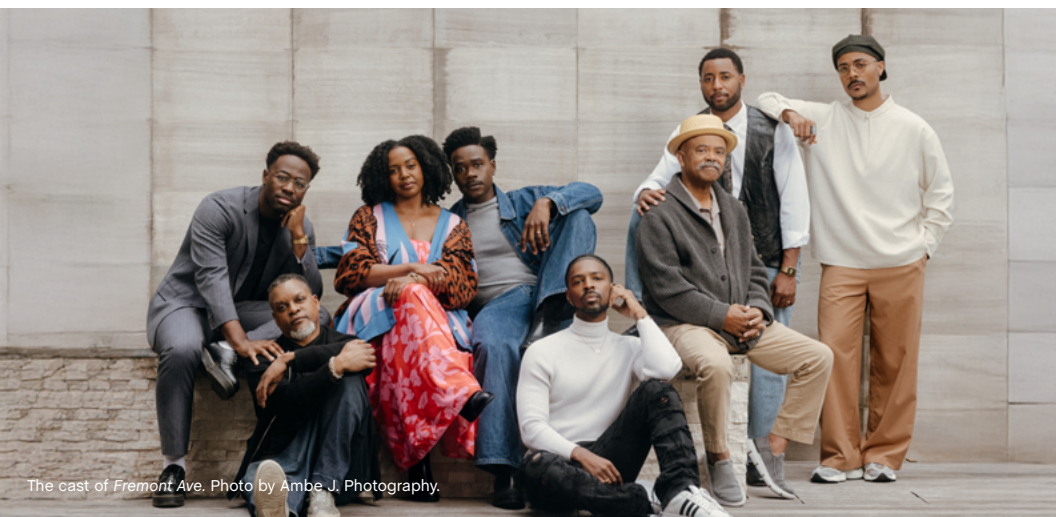
The cast of Fremont Ave.